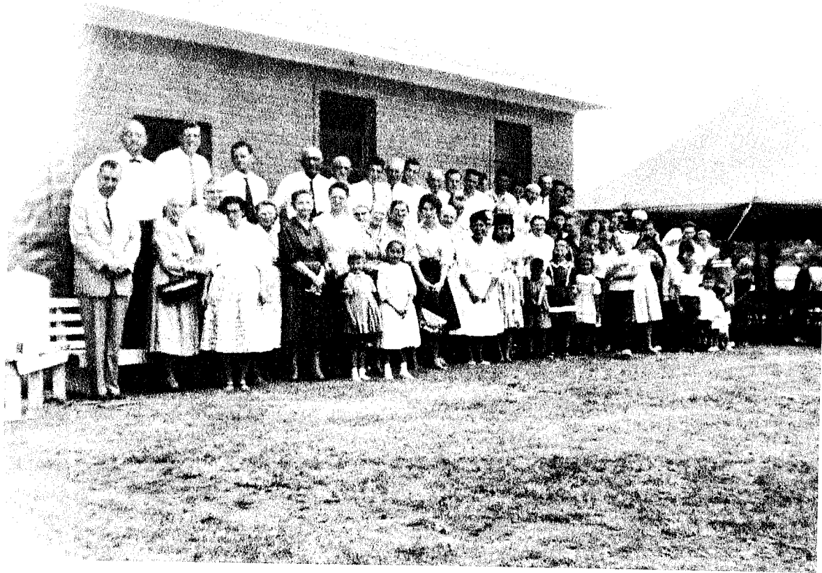
TEXAS DISTRICT CONFERENCE AT DALLAS, TEXAS